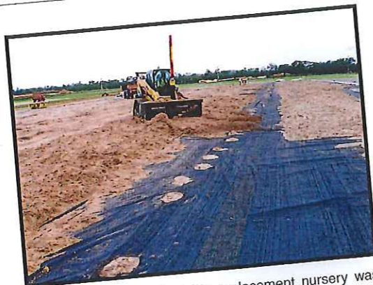
A key design element of the replacement nursery was installation of an impermeable plastic layer, placed directly on the formed clay base, onto which the amended sand media was placed.