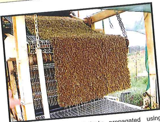
The nursery was vegetatively propagated using foundation stock harvested and mechanically washed at the company's turf farm at Camden.