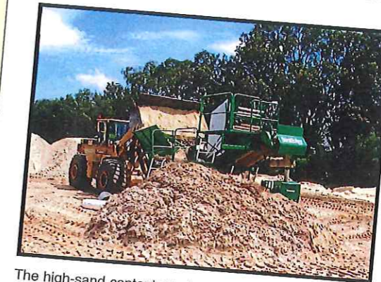
The high-sand content growing media was produced and quality controlled using a washed quartz-sand, amended with Canadian peat and finally mixed with 'Netlon' mesh element.

The prescribed maintenance program included numerous turfgrass quality fertilisers, chemical treatments including growth stimulants, mowing and finally ryegrass oversowing in March, 2012.