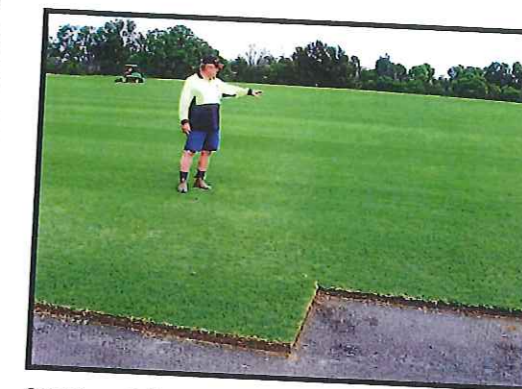
Grassing of the replacement nursery was conducted during April, 2011 to allow for a mature sward with a well-developed root system to ensure high sod strength for harvest, installation and an elite playing surface.